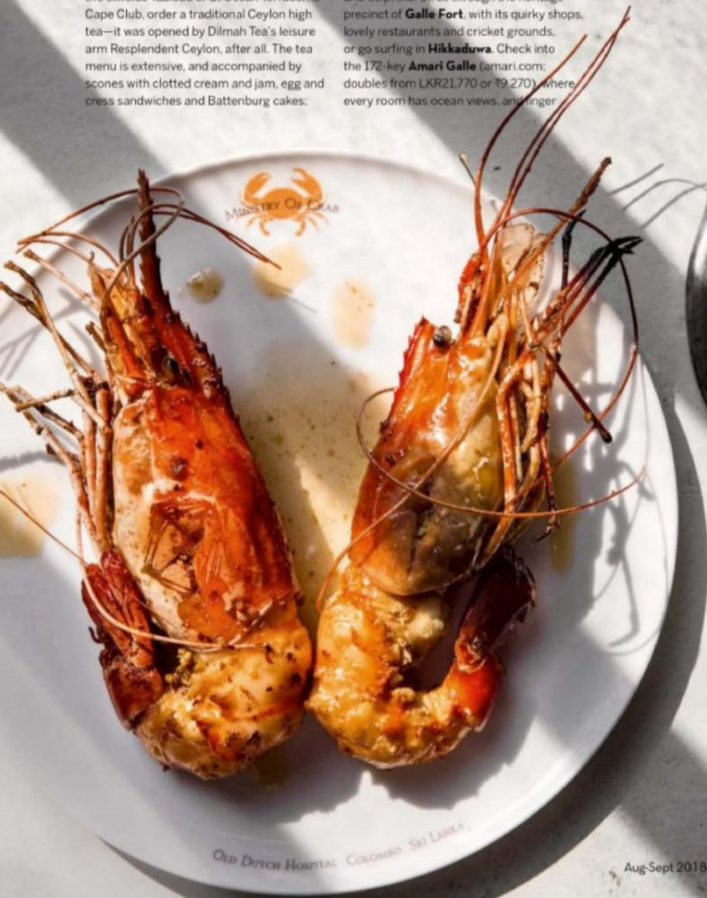
A seafood dish at Ministry of Crab

Spend the next morning in the company of the gentle giants of the sea off the coast of Mirissa : November–April is ideal to sight blue whales, sperm whales and dolphins. Stroll through the heritage precinct of Galle Fort , with its quirky shops, lovely restaurants and cricket grounds, or go surfing in Hikkaduwa . Check into the 172-key Amari Galle ( amari.com ; doubles from LKR21,770 or ₹9,270), where every room has ocean views, and finger